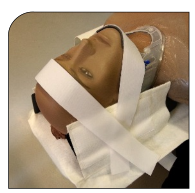
TT-Cover 2014™ - Disposable cover with an integrated head support. It is designed for optimum tensile strength. The 2014 version is upgraded in many ways and has been made a lot more userfriendly.

NOTE! We advice all users to only use these solutions, designed for use with TraumaTransfer™