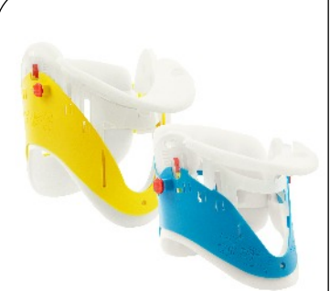
AEROresc® - EASY Collar combines the best from the market leaders in collars. EASY Collar can be adjusted to 16 sizes, to obtain full adaption. Comes in an adult, military and paediatric version. Certified for use with TraumaTransfer™.

\textbf{Pelfix}^{\intercal M} \ \textbf{Pelvic fixation} - \textbf{Set of} cushions designed to prevent sideways sliding. Set with two large and two small cushions for different sizes of patients.