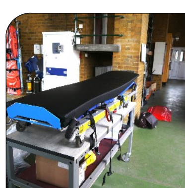
TT-Transporter™ - is a mattress that provides a flat surface on the Alfatrolley, during transports with TraumaTransfer™

BedSlide™ - Flexible sliding board for transferring or lifting of patients