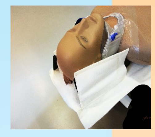
Center the VFLEXFIX™-straps over the chin and press and secure the straps to the velcro on the outer sides. Center and secure the other strap over the forehead the same way. Avoid covering the ears!