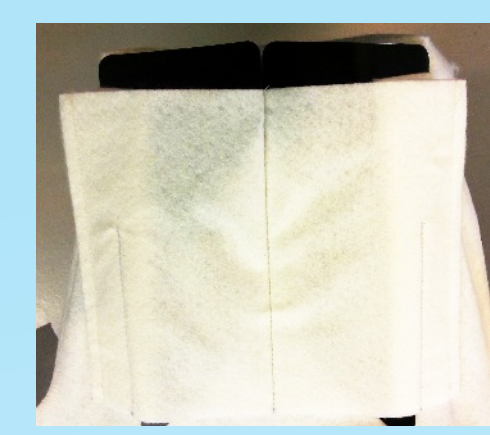
B. Place the patient centred with the head level with the top end of TraumaTransfer™ .Pull out the black plastic profiles 10 cm and gently turn the left profile counterclockwise and the right profile clockwise, until they are in an almost up-right position. Gently push them down again.