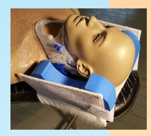
Center the VFLEXFIX™-straps over the chin and press and secure the straps to the velcro on the outer sides. Centre and secure the other strap over the forehead the same way. Avoid covering the ears!