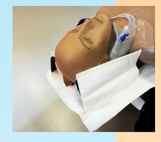
Center the VFLEXFIX™-straps over the chin and press and secure the straps to the velcro on the outer sides. Centre and secure the other strap over the forehead the same way. Avoid covering the ears!