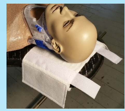
B. Place the patient centred with the head level with the top end of TraumaTransfer™ .Place the head cushion ( TTHEADFIXKLH or TTHEAD-FIXKLMH ) according to the picture.