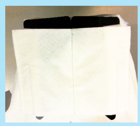
B. Place the patient centred with the head level with the top end of TraumaTransfer™ .Pull out the black plastic profiles 10 cm and gently turn the left profile counterclockwise and the right profile clockwise, until they are in an almost up-right position. Gently push them down again.